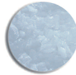
SF-Series 900 Flake Ice Machine on B-570 Bin