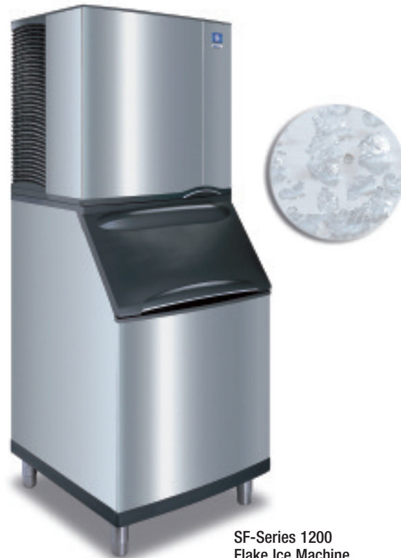
SF-Series 1200 Flake Ice Machine on B-570 Bin